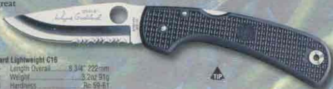
Wayne Goddard Lightweight C16

This high-performance design is an evolution of the original Spyderco/Goddard collaboration series. The drop-point style blade features ATS-55, a premium stainless steel that is new to the industry and the CLIPIT line. Made exclusively for knives, this steel adds cobalt and copper to an already good mix of carbon and chromium and provides exceptional hardness, edge retention and corrosion resistance. The ergonomic handle is formed of fiberglass-reinforced nylon resin and incorporates a more pronounced Volcano Grip pattern for an excellent hold. A stainless steel clip attaches to the handle via a hollowed-out screw that fits through (yet still retains) the lanyard hole. This clip is removable and reversible for left / right carry. Boasting strength and affordability, the Wayne Goddard Lightweight is great for indoor and outdoor use.